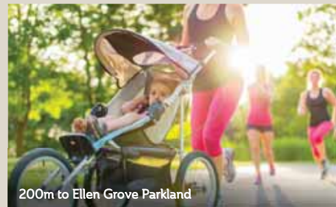
200m to Ellen Grove Parkland