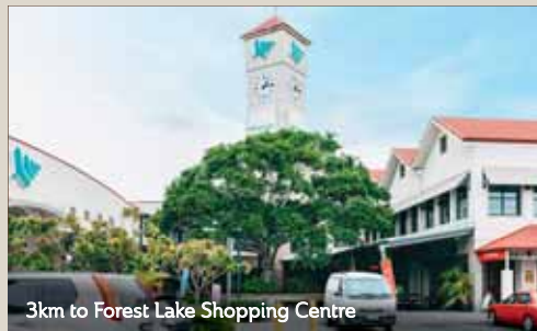
3km to Forest Lake Shopping Centre

With the best of Forest Lake only moments from your door, you will enjoy a lively urban lifestyle. A vibrant mix of cafés, farmers’ markets, supermarkets and locally owned specialty stores are just minutes away. Walk to parks, schools, childcare and medical services.