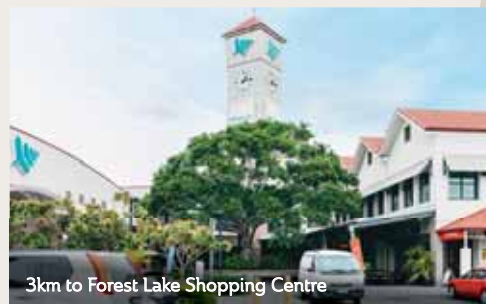
3km to Forest Lake Shopping Centre

From low maintenance lifestyles to the entertainer's dream home, Arbor at Ellen Grove offers thoughtfully considered homesites no matter your lifestyle. Live within a peaceful and connected community with quiet residential streets, where knowing your neighbour is part of everyday life.