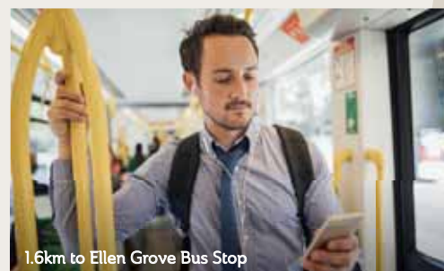
1.6km to Ellen Grove Bus Stop