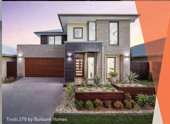
Tivoli 279 by Burbank Homes